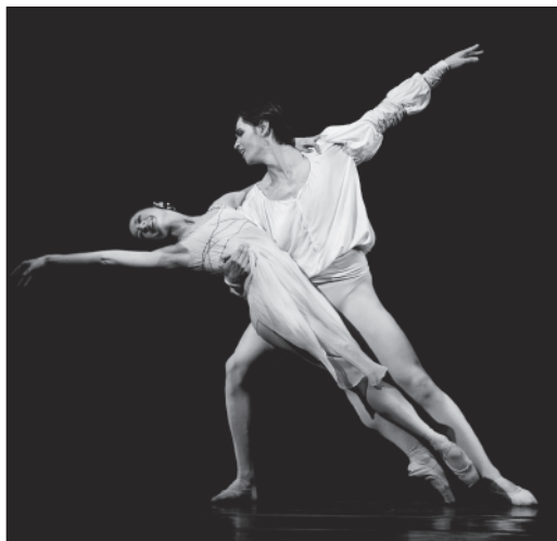
Scene from a 2010 Royal Swedish Ballet production of Romeo and Juliet