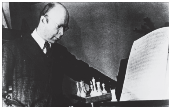
Prokofiev, an avid chess player, ca. 1930

To learn more, visit the New York Philharmonic Leon Levy Digital Archives at archives.nyphil.org .