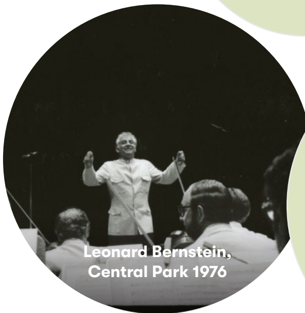
Leonard Bernstein, Central Park 1976

Music from West Side Story by Philharmonic Laureate Conductor Leonard Bernstein tops the list of most-performed works at the Concerts in the Parks; it's appeared 48 times, including on July 4, 1976, in Central Park, conducted by the composer himself.